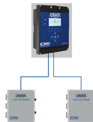
Multiple sensors on a single analyser