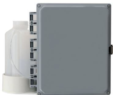
Automatic Chemical Cleaning System