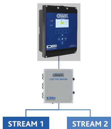
Dual sample feed capability