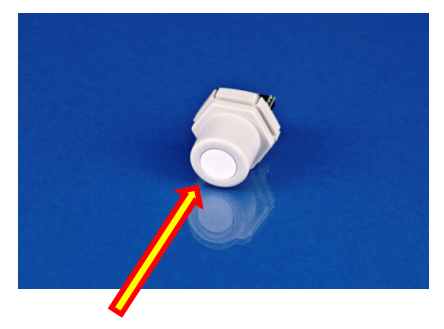
Special filter for IP65 protection of combustible gas gas sensor