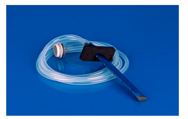
Duct Mounting Set DMS 300G

Combustible gas detectors G-series gas sensor head.