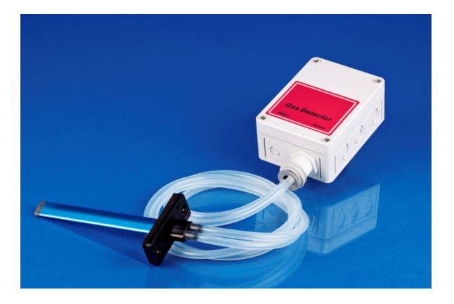
Duct Mounting Set DMS 300G assemblied with Combustible gas detectors G-series