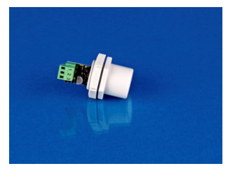
Combustible gas sensor with PCB, easy to replace when life time exceeded.

Combustible gas sensor with PCB manufactured on request. As the storage life is limited for unpowered Combustible gas detectors we need pre-payment before process the order, this to avoid any cancellation of order. Delivery time is normally 5 weeks after receipt of payment.