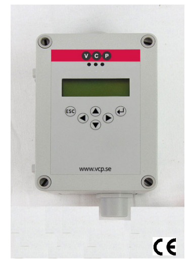
Combustible gas detector with LCD display G-series for wall mounting