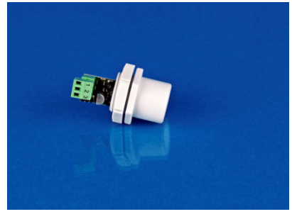
Combustible gas sensor with PCB, for example XGCH4 100