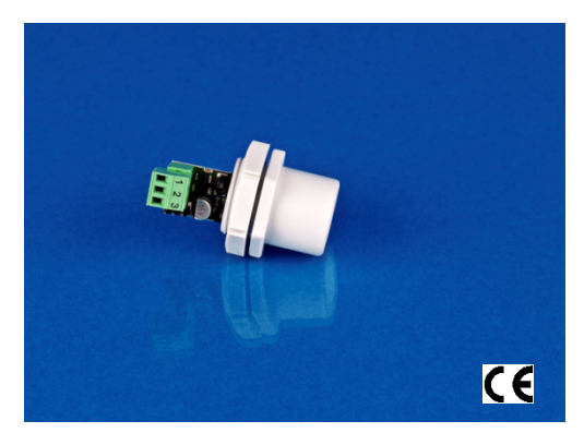
Combustible gas sensor with PCB, easy to replace when life time exceeded