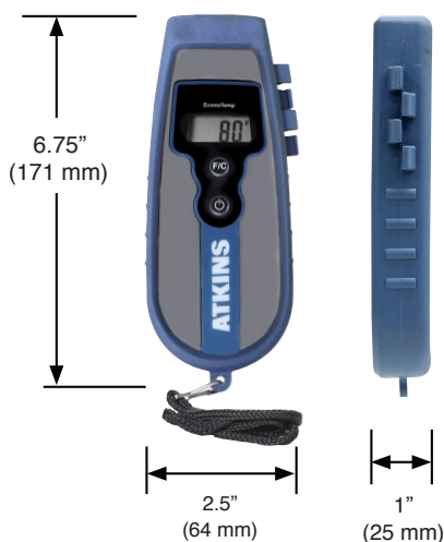
32311-K Thermocouple Instrument

94020-K Combo Pack (32311-K Instr. and 50337-K Probe) • Individual Package Weight: 12 oz (340 g) • Package Dimensions (L x W x H): 5" x 2.125" x 10" (127 mm x 54 mm x 254 mm) • Package Cube: 0.07