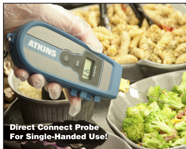
Direct Connect Probe For Single-Handed Use!