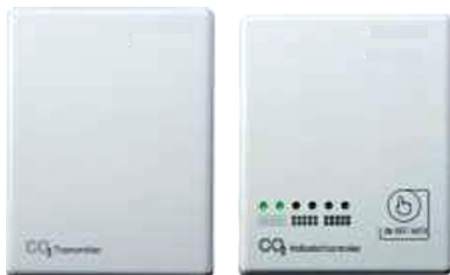
TSM-CO2-S series TSM-CO2-L series