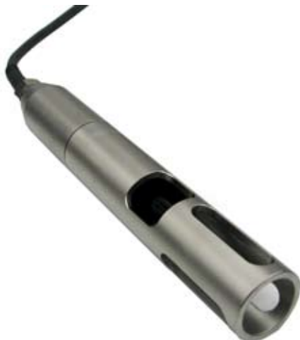
WQ-FDO shown with stainless steel armor

Highly Accurate and Stable Optical Dissolved Oxygen Sensor