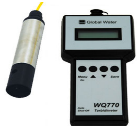
WQ770-B Turbidity Meter with the WQ730 Turbidity Sensor.