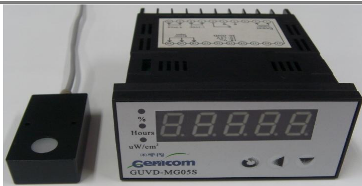
Fig. 1 UV Radiometer 5.0 (Size of Display : 97 × 50 × 112mm 3 )