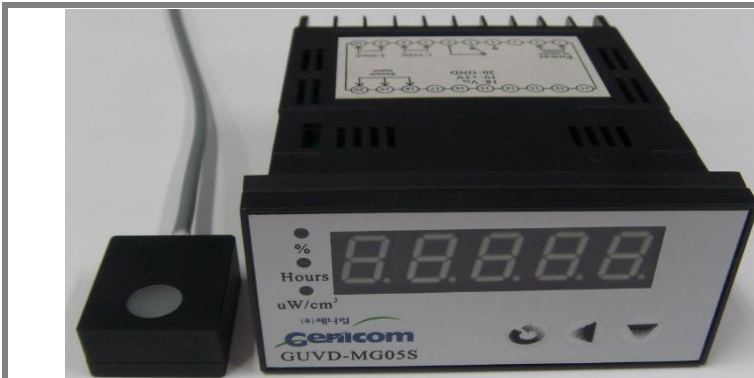
Fig. 1 UV Radiometer 5.0 (Size of Display : 97 × 50 × 112mm 3 )