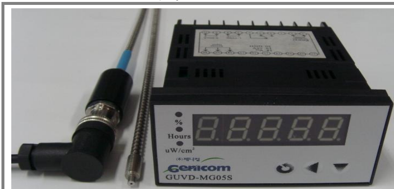
Fig. 1 UV Radiometer 5.0 (Size of Display : 97 × 50 × 112mm)