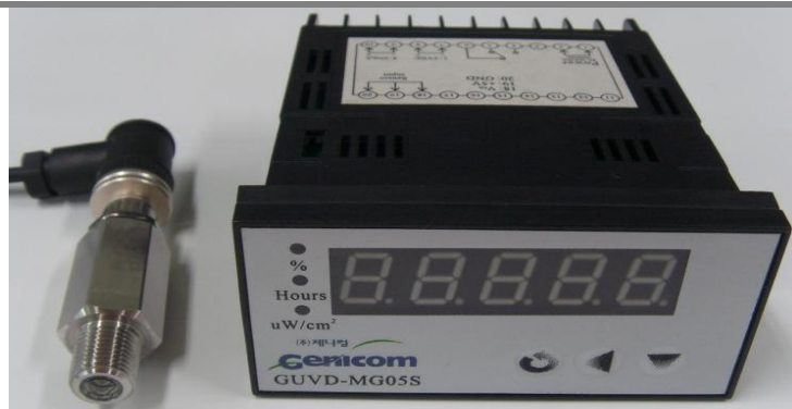
Fig. 1 UV Radiometer 5.0 (Size of Display : 97 × 50 × 112mm)