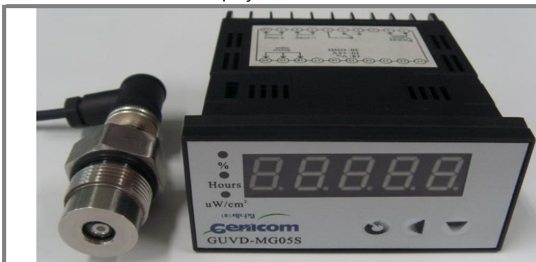
Fig. 1 UV Radiometer 5.0 (Size of Display : 97 × 50 × 112mm)