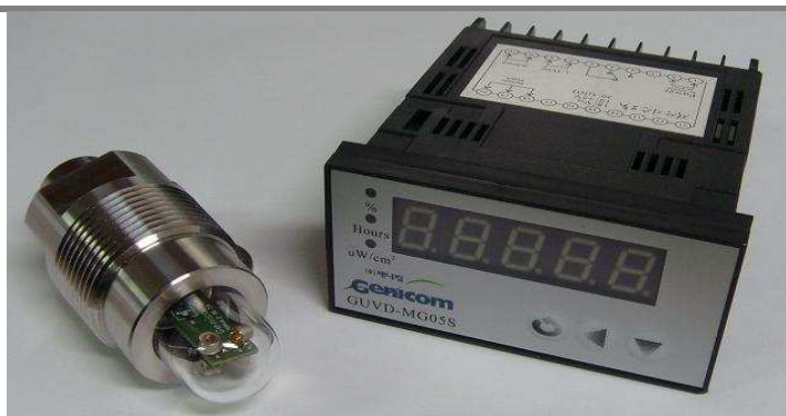
Fig. 1 UV Radiometer 5.0 (Size of Display : 96 × 48 × 112mm 3 )