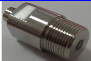
LV10 Probe (Socket : 20A PT tab SUS)

Applications UV Power Measure UV Lamp Monitoring