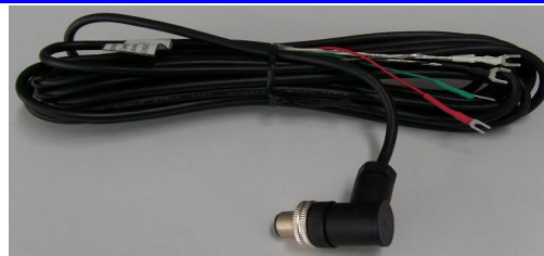
Connection Cable (IP67, 5m)