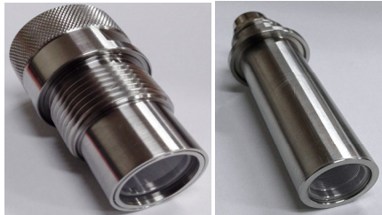
GUV-C-T11GW-DVGW (left ,Measuring window tube) GUV-C-T11GC-DVGW (Right , Sensor shaft)