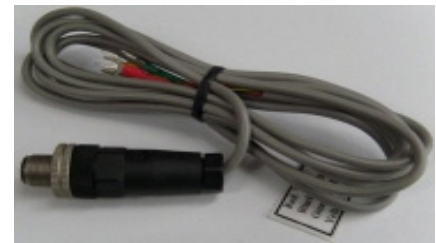
Connector (IP67, 5m)