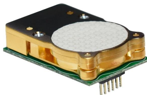
COZIR™ LP CO 2 Sensor