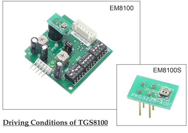
VH: 1.8V (Continuous energizing)